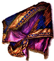
PRAYING WITH MY EYES OPEN