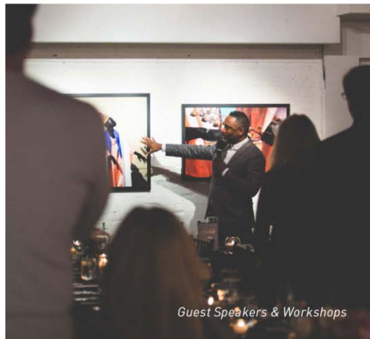
Guest Speakers & Workshops