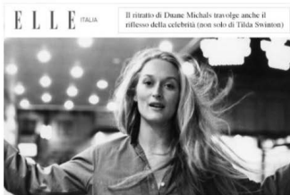
March 30, 2019. Arte - Duane Michals exhibition in Elle Italia online, "La prima panoramica completa del lavoro sul ritratto di Duane Michals, inteso a stravolgere il rapporto con la fama e lo spazio dello Snap! Space di Orlando, prima di raggiungere il Fenimore Art Museum di New York." ... read more